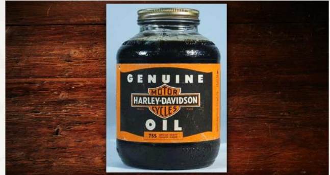
Due to war-time restrictions in steel, Harley-Davidson begins shipping oil in glass containers.

Harley-Davidson began offering oil for sale to its customers beginning in 1909 and continues to do so today. Over the years, oil has come in a variety of containers and shipping configurations. During World War II, Harley-Davidson responded to the steel shortage by shipping oil in glass containers. This was one of many methods Harley-Davidson employed to aid in the war effort. After the war, Harley returned to using metal containers for its oil.