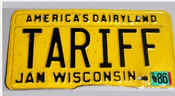
President Ronald Reagan signs tariff into effect.