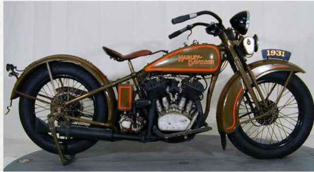
Harley-Davidson begins offering a reverse gear on the VL models.

On April 6, 1931, Harley-Davidson announced that it would begin offering a built-in reverse gear on all 74" Big Twins. This gear allowed the motorcycle to run backwards, something that wasn't possible on previous motorcycles. Motorcycles at the time had three-speed gear boxes and the addition of this fourth gear required a design change in the gear box and cover. This meant that anyone wanting the reverse gear had to purchase a new motorcycle, as it could not be added to older machines. Furthermore, the reverse gear was only available on 74" Big Twin VL models.